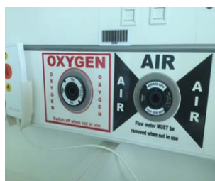
Figure 2: Example of a terminal unit warning label

Similarly to the use of flaps on medical air flowmeters, labels have a limited impact on reducing human error when implemented on their own. They can however be effective if used in combination with other approaches as they help to differentiate between different gas outlets.