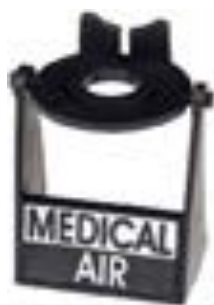
Figure 5: Medical air flowmeters are fitted with a labelled, movable 'guard' that covers the tubing connection to raise awareness of gas selected (left) and air blanking plugs are fitted to all outlets not in use