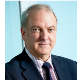
Prof Sir Bruce Keogh, NHS England Medical Director

“This review will enable us to identify good practice that can be used to inform a set of principles and standards that NHS organisations will be encouraged to use and adopt, making it easier for them to work with industry.”